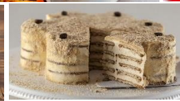
Bolo de bolacha