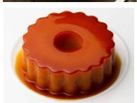
Pudim Abade Priscos