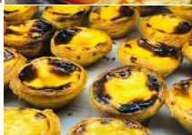
Pastel de nata