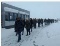
Participants visiting MAXIV and ESS in February

This year's annual joint workshop between Copenhagen Plant Science Center (CPSC) and PlantLink was hosted by MAXIV and ESS. This was a chance to learn more about the new facilities and to interact with regional plant researchers and researchers working at MAXIV and ESS.