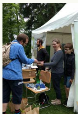
The PlantLink science tent during the Fascination of Plants Day in Lund Botanical Gardens 20 May 2017

We would like to remind all plant researchers at LU and SLU that you can join EPSO for free as an individual member by visiting their homepage.